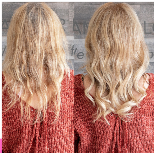
ONE GLAMOUR TRACK