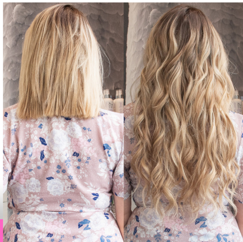
TWO GLAMOUR TRACKS